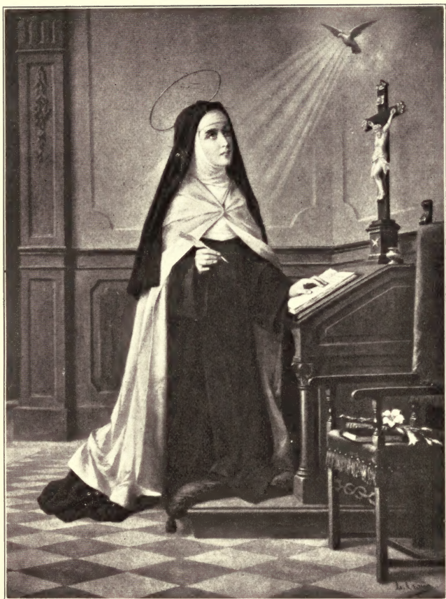
ST. TERESA OF JESUS Reformer of the Order of Mt. Carmel